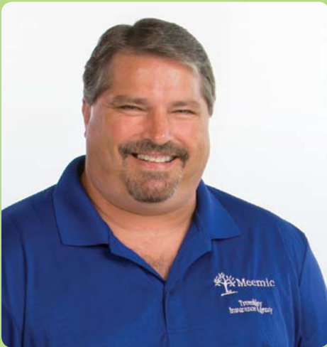
Keiven Trombley Agency, Inc.

505 West Midland Road Auburn, MI 48611 989-662-4474