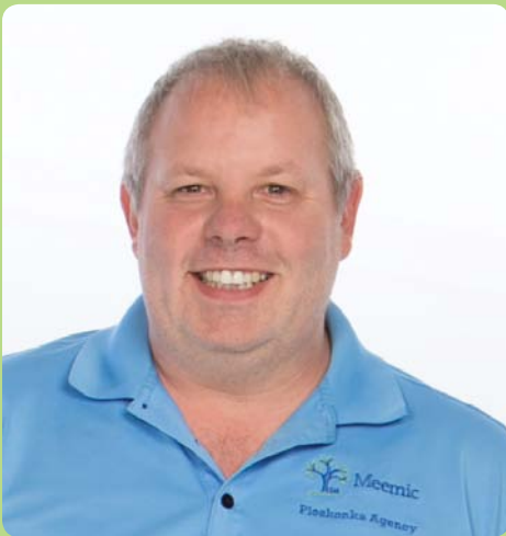
John M. Ploskonka Agency, LLC

925 South Main Street Royal Oak, MI 48067 248-399-7644