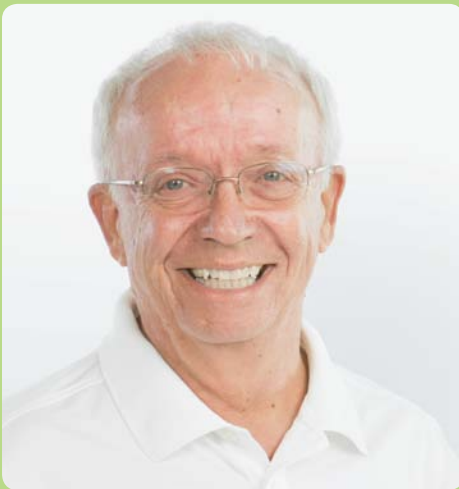
John T. Burke Insurance Agency

17713 14 Mile Road Fraser, MI 48026 586-293-1185